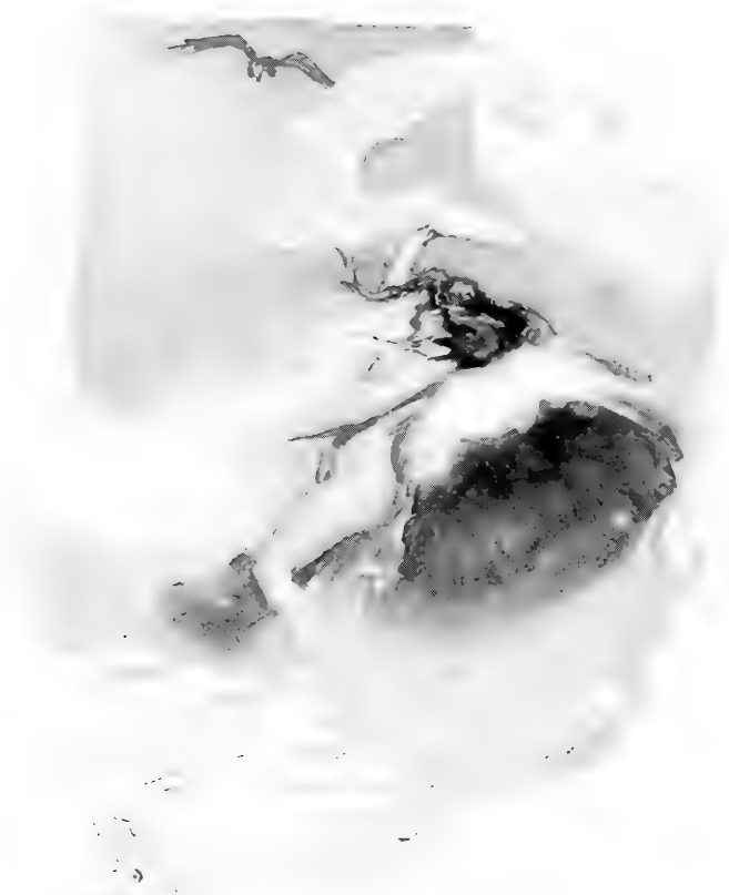
"THE GODDESS THERE IN HER OWN HANDS RECEIVED IT."—Page 296.